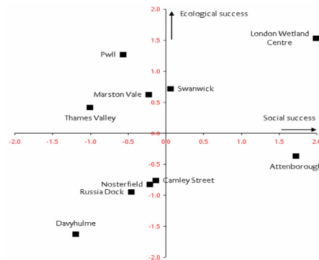
Combined ecological and social success at 10 sites (initial results)

The influence of additional social, environmental and hydrological data statistically determined.