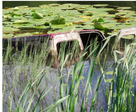
Darcy Lever (Bolton) highlighting the importance of considering the ecological and social success of a site

An investigation is underway as part of the SUBR:IM programme to establish the relative success of wetland re-creation on post-industrial or other brownfield sites. Such schemes can offer considerable potential for development as wetland habitats, enhancing the ecological, hydrological and social value of these formerly degraded sites.